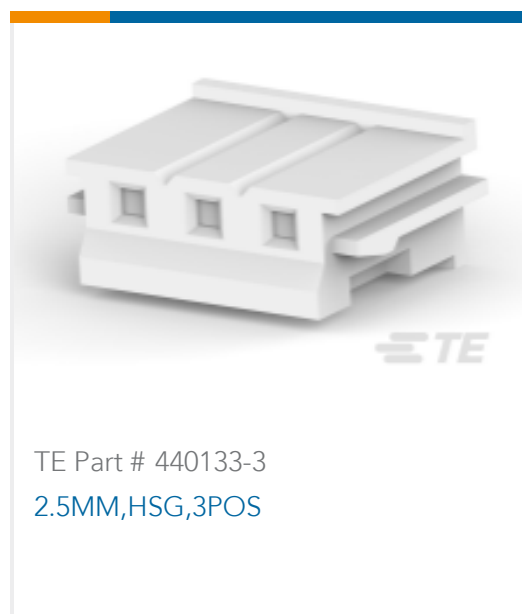
TE Part # 440133-3 2.5MM,HSG,3POS