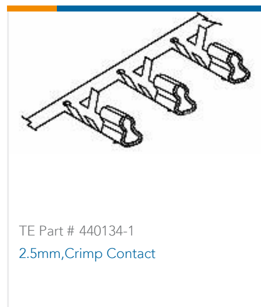
TE Part # 440134-1 2.5mm,Crimp Contact